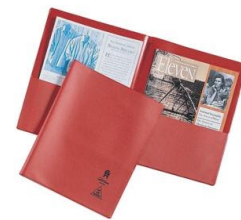
5 plastic pocket folders (with brads: red, blue, yellow, green, & black)